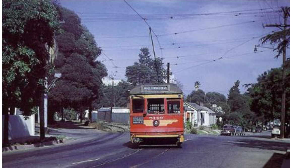
Pacific Electric Red Car traveling west on Hawthorn adjacent to the project site.

Please deny the CEQA categorical exemption for this project. The site was developed in the early 20 th Century as part of the Red Car streetcar line at Gardner Junction.