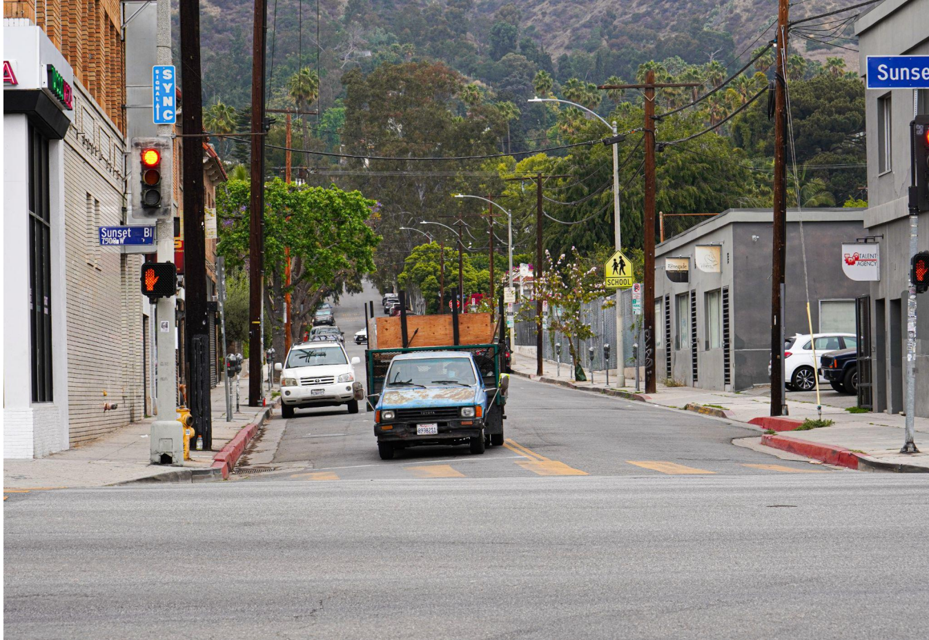
Cyclone fencing next to the project site borders the school playground. Note the narrow sidewalk on a street already further narrowed during business hours by parked cars.